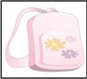
This is a handbag.