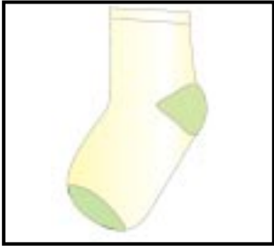
This is a sock.